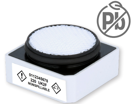
Oxygen (O 2 ) Sensor: 102 Part Number: AAW85-07WA-CIT

With the 1series low-profile design, the sensors have turrets to mount into the front of the instrument in order to minimize instrument height. This revolutionary design also simplifies target-gas access to the sensor face and features an option for a replaceable external membrane.